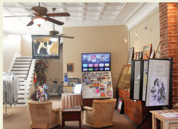
Jim the Wonder Dog Museum 101 N. Lafayette (next to the Jim Garden)

Bring your dog to meet Jim and participate in the events of Wonder Dog Day on May 16!