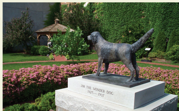
Jim the Wonder Dog Garden The most photographed place in Marshall