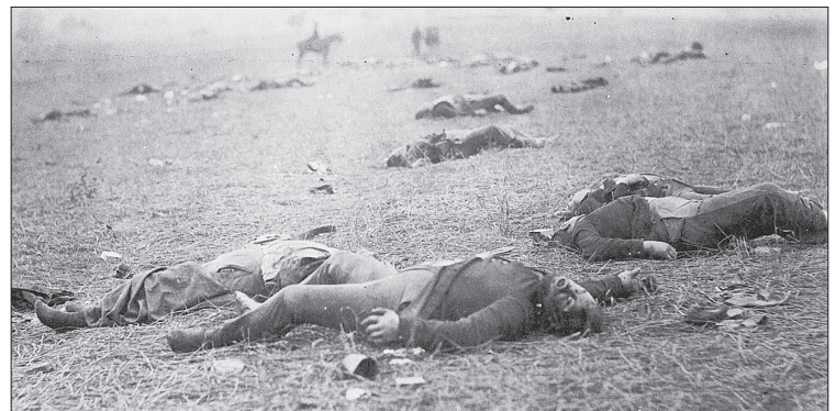
The three-day battle at Gettysburg resulted in mass casualties on the Union and Confederate sides with an estimated 51,000 soldiers missing, wounded or killed in the battle.

This Newspaper In Education series was created by The Joplin Globe in partnership with the U.S. Department of Education Teaching American History Project, the East Newton R-6 School District, the Southwest Center for Educational Excellence and the Missouri Southern State University Social Sciences Department.