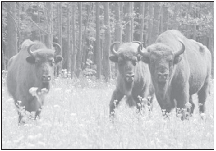
Bialowieza Forest

Starting with 12 animals, they have built the population back to about 3,000.