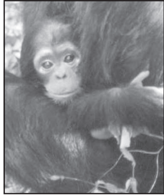
Michaelmas (left) and Mike (right) were photographed at the Gombe National Park.

Somalia Pretoria Kenya Kampala Sudan Nairobi Mogadishu Egypt Uganda Cairo South Africa Khartoum