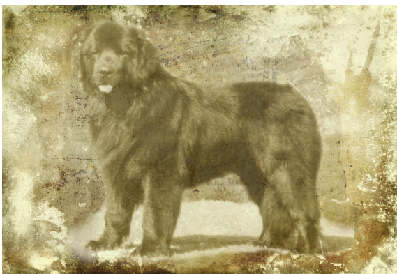
Photo showing what Brutus might have looked like.

Brutus made contributions at Antietam. Many people make contributions to others, giving their gifts of time and/or money. These contributions are recognized in newspaper photos and stories. Find two photos noting others' contributions to community.