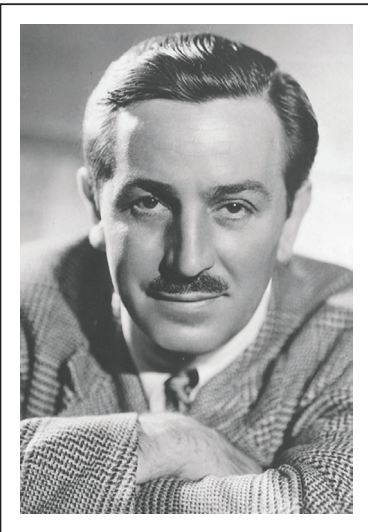
"To tell the truth, more things of importance happened to me in Marcelline than have happened since — or are likely to in the future." WALT DISNEY, 1938.

If you visit the parks, you'll notice little hints of Walt's ties to the Show-Me State at Disneyland and Disneyworld, where Main Street USA areas are modeled after the Marcelline that Walt knew as a child. Plus you can get a taste of Missouri in the Marcelline Confectionary at Disneyland.